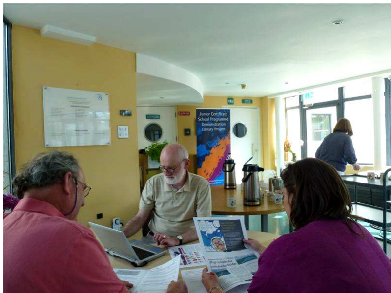
ACT Committee members working on a response to the CSPE exam paper June 2013